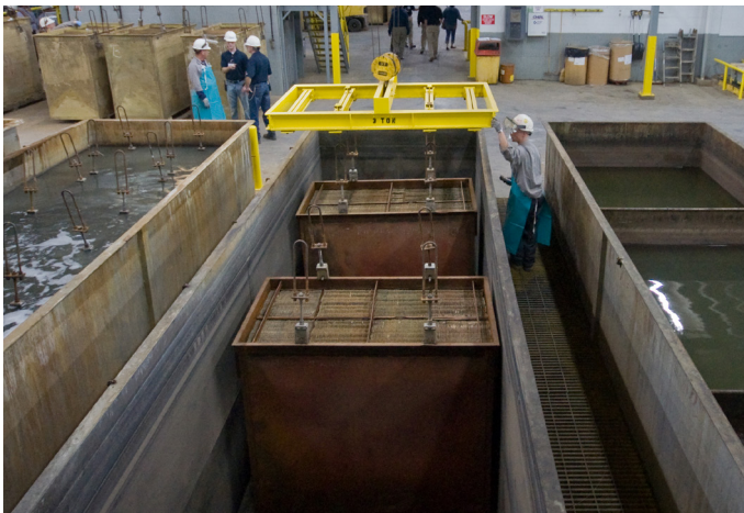
Regeneration restores catalyst activity back to original OEM levels.

CORMETECH has been a pioneer and leader in regeneration with over 20 years of experience with our patented cleaning and regeneration processes. The regeneration process removes catalyst deactivation compounds and restores catalyst activity for all types of SCR catalyst (i.e. corrugated, honeycomb and plate). Catalyst regeneration reduces operation and lifecycle management costs. Our Selective Impregnation® process achieves a lower SO 2 to SO 3 conversion ratio while maintaining a higher catalyst activity.