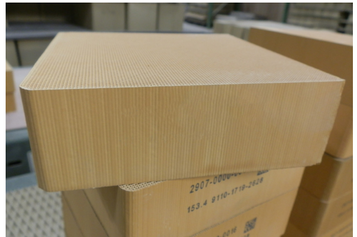
CORMETECH's catalyst can be cut and engineered to order.